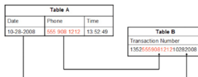
Figure 3: Confidential information hidden in compound fields poses a privacy risk to the organization

Some sensitive data is easy to find, for instance, telephone numbers in a column named 'tel_number'. However most application databases are more complex and sensitive data is sometimes compounded with other data elements or buried in text or comment fields. Data in one system may be moved and manipulated to be used in other places. Subject matter experts (SME) can sometimes offer insight, but only if they fully understand the system.